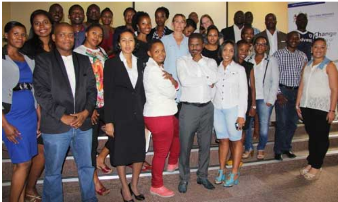
Participants of the February meeting of the GCC Forum