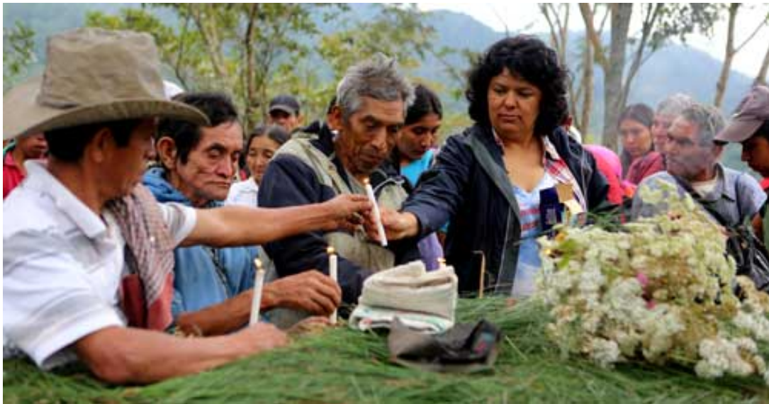
Berta Cáceres, at an action with the communities she worked for